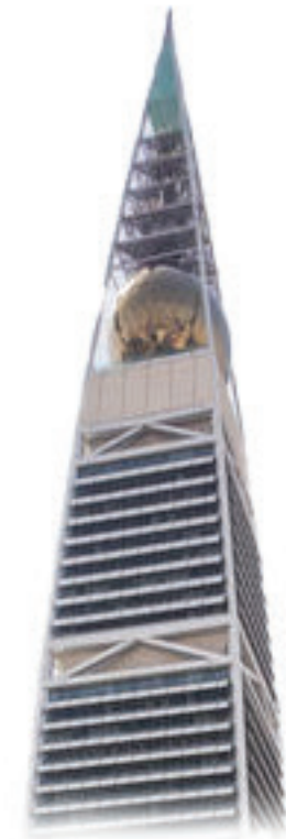
Al Faisaliah Tower