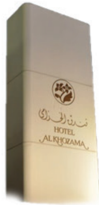
Al Khozama hotel